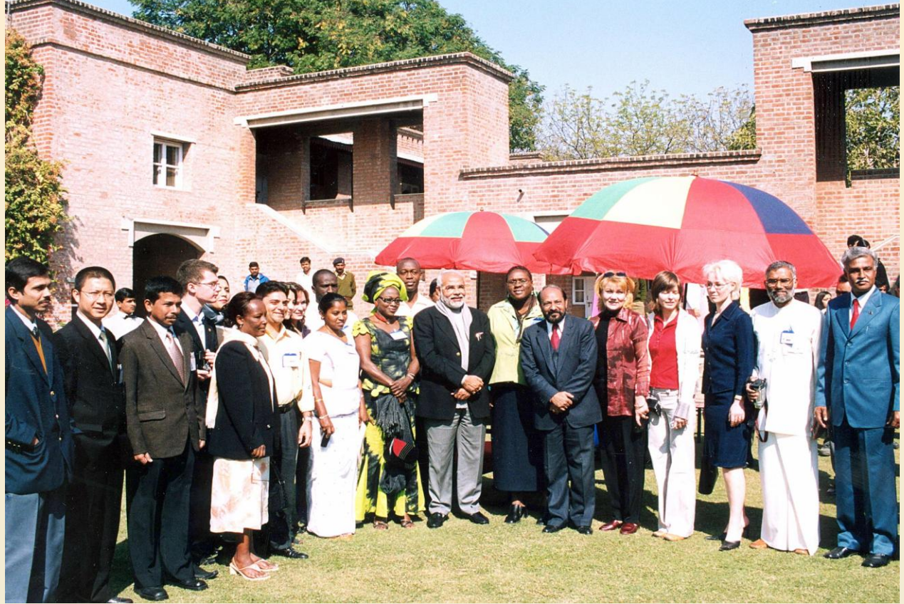
2005-06 ITEC participants with Shri Narendra Modi, the then Chief Minister of Gujarat, and the current Prime Minister of India

Flavour Development Centre), WTO related topics (Centre for WTO Studies, Indian Institute of Foreign Trade), etc. Also, some innovative courses are offered under ITEC, including one on solar technology for semi-literate and illiterate grand mothers from the Least Developed Countries at Barefoot College, Tilonia .